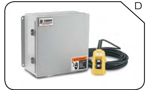
Custom controls available for special applications.

TORQUE LIMITERS as part of the motor controls.