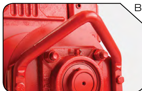
Lifting handles provide easy attachment points for lifting straps.