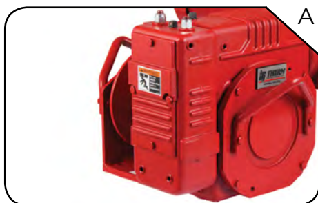
Mechanical brake for lifting applications.

2 YEAR MOVE IT WITH CONFIDENCE LIMITED WARRANTY leads the industry.