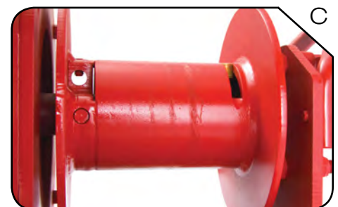
Drum features a set screw slot (left) and keyhole slot (right).