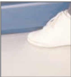
Full Perimeter Electric Toeguard

115V, 1/2HP external power unit assembly W/24VAC control voltage on LX-25 or LX-50 230V, 1 Phase, 2HP external power unit assembly W/24VAC control voltage 208/230V, 3 Phase, 2HP external power unit assembly W/24VAC control voltage