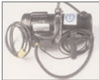
Remote Power Unit