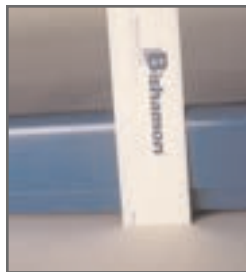
2.9" Lowered Height On Models Up To 1,100lbs