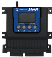
MHR RADIO CONTROLLER

Setting a new standard in performance, dependability, and value, the inteSmart2 Receiver is well suited to a variety of applications and industries. It can be customized with several frequency options, analog and digital inputs, and has the ability to add additional relays if required.