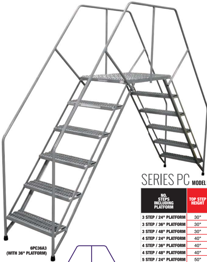
6PC36A3 (WITH 36" PLATFORM)