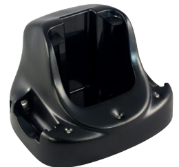
Charging Cradle Available for Easy Recharge