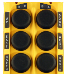
Labels Located Next To Buttons for Easy Visibility and Durability