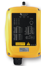
Flex EX 4/6 Receiver

Flex EX2 receivers were designed with field installation and serviceability in mind. Receivers come prewired with 6' of cable and mounting hardware allowing fast installation. Onboard diagnostic and output LEDs provide useful system status information when installing and troubleshooting. All components are easily accessible and field replaceable.