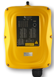
Flex EX 8/12 Receiver

For more information, contact your local Magnetek Sales Representative, radio.sales@magnetek.com , or the Magnetek location nearest you.