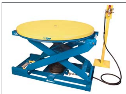
EZU-15-R With Optional Valve Stand

* Stainless steel model for washdown and clean room applications All accessories are field installable