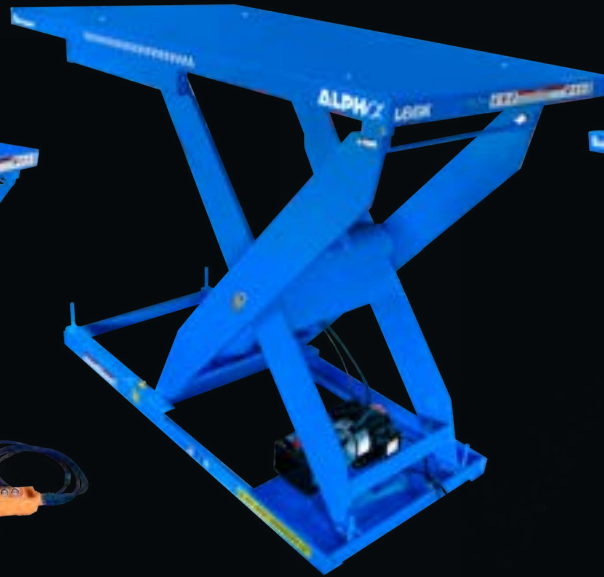
Alpha L66K 6,600 lb. capacity