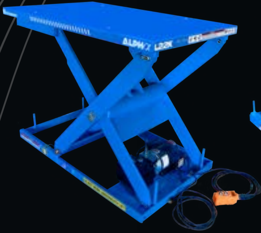
Alpha L22K 2,200 lb. capacity