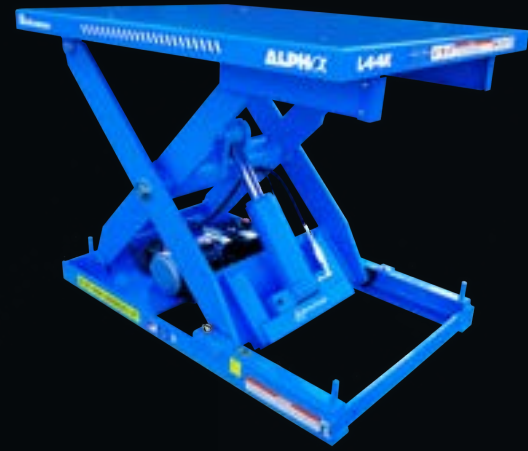
Alpha L44K 4,400 lb. capacity