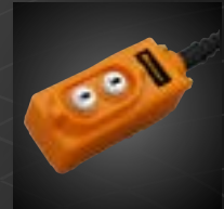
Hand Control Standard

*Note: Turntable (TT) models use the modular holes to attach the turntable top to the table. The turntable top will not have modular holes.