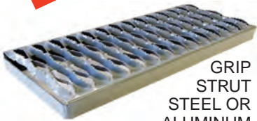
GRIP STRUT STEEL OR ALUMINUM

Handrail cross tube standard on aluminum models