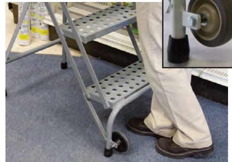
COTTERMAN PERFORMA PERFORATED TREAD FOR GENERAL USE IS OUR MOST SLIP RESISTANT TREAD

The New Cotterman StockN-Store ladder provides an easy convenient means to access shelving or other work areas. This lightweight ladder easily folds into a compact assembly for quick rolling movement and storage. In use, the ladder opens smoothly during the transition from rolling to setting down on rubber feet, the hinges automatically locking in place. For added convenience, the ladder tilts and rolls in the open as well as closed position.