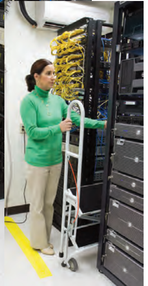
SOLID TREAD WITH RUBBER MATTING IS GREAT FOR OFFICES OR RETAIL ENVIRONMENTS