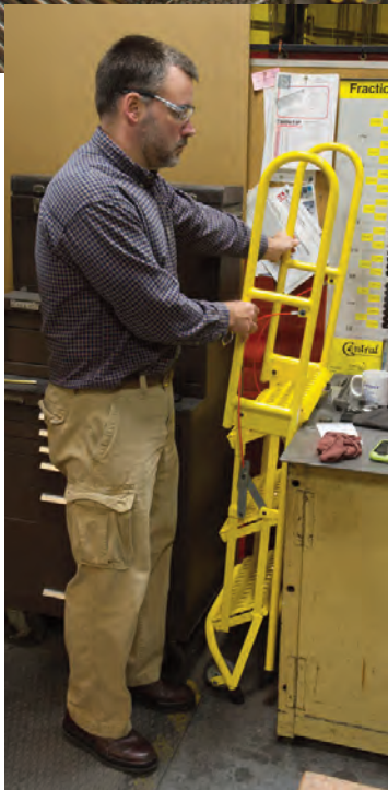
GRIP STRUT TREAD PROVIDES MAXIMUM SLIP RESISTANCE IN INDUSTRIAL ENVIRONMENTS