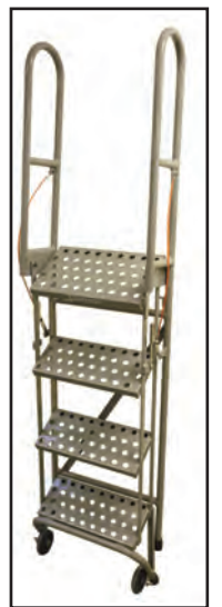
OPEN-READY TO USE FOLDED-TO STORE